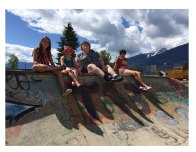
Essential Service Worker learners at NES on a morning walk