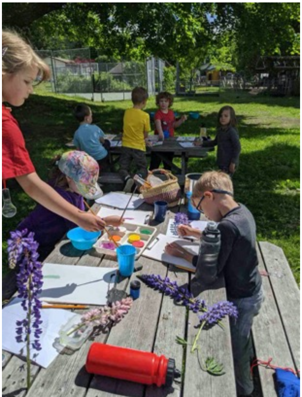
Ms. Conne's K/1 class at Lucerne creating scientific drawings of lupins

Many thanks to our educators for their phenomenal support of all students working remotely and in person, and kudos to all staff for their adaptivity and flexibility with students firmly at the core!