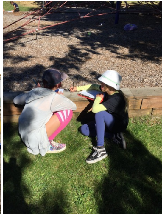
Grade 6/7s engaged in Math learning