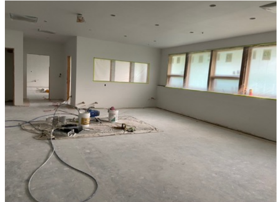
Walls, electrical and plumbing are done