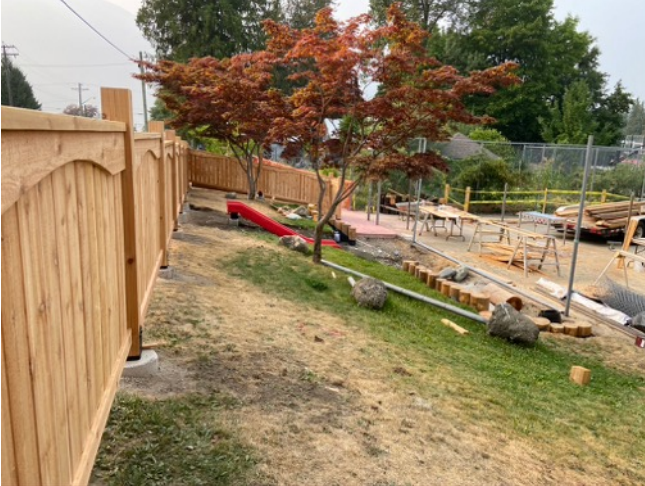
New fence & new walkway surround trees in outdoor play area