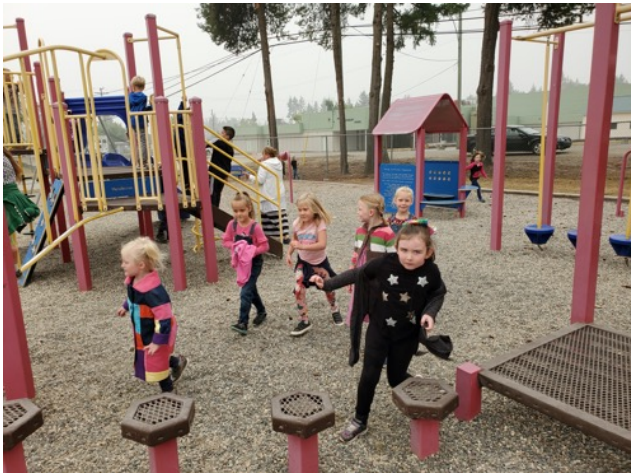
Outside play for NES primary learners