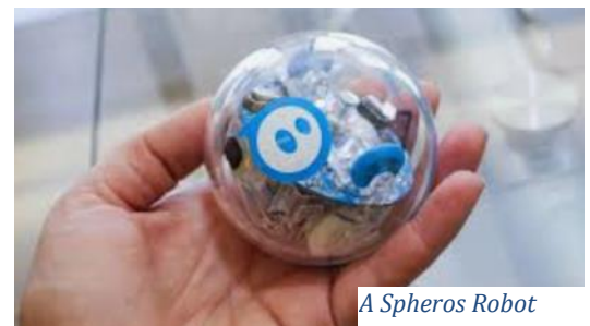
A Spheros Robot