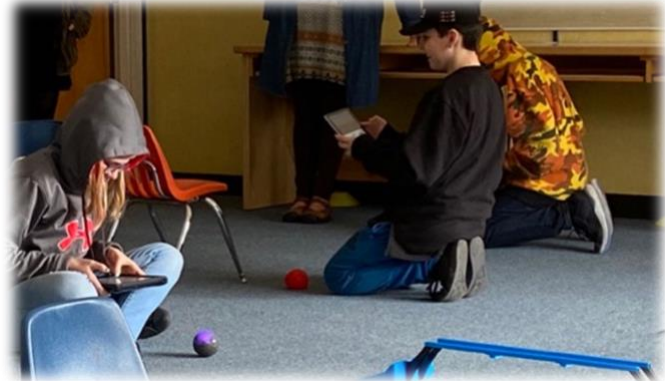
EES Spheros coders immersed in the Agility Gymnastics Course