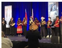
Student Indigenous Student Jazz Band Presentation