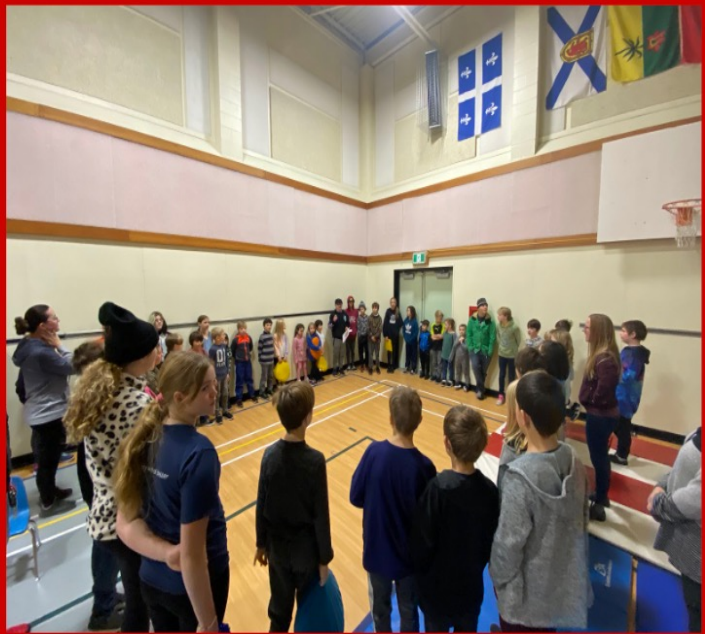
Intramurals are Back!