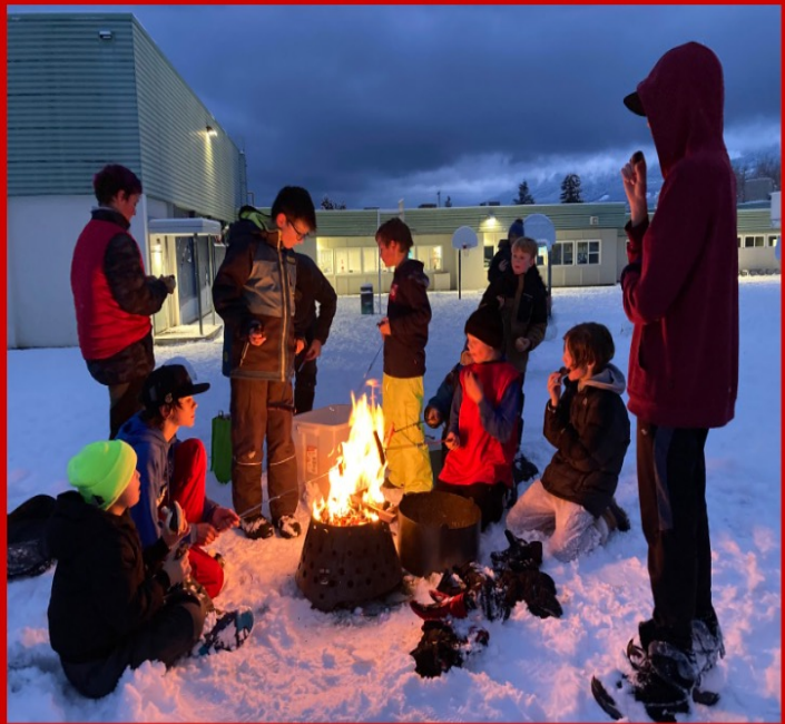
Winter Club Wind up