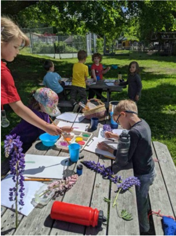
Ms. Conne's K/1 class at Lucerne creating scientific drawings of lupins