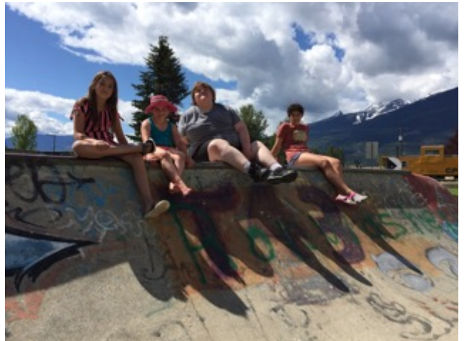
Essential Service Worker learners at NES on a morning walk