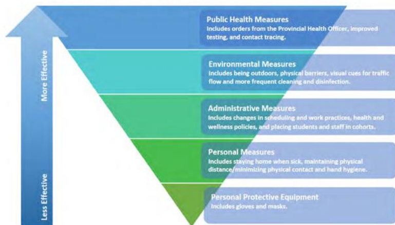
The Hierarchy for Infection Prevention and Exposure Control Measures for Communicable Disease