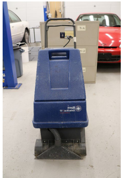
15. Aquaclean Classic Carpet Cleaner